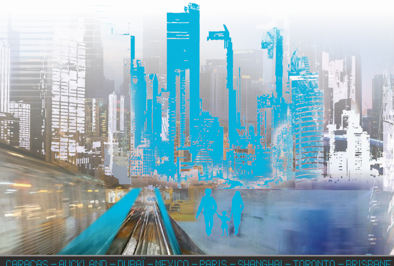
CARACAS - AUCKLAND - DUBAI - MEXICO - PARIS - SHANGHAI - TORONTO - BRISBAI

Thales solutions for the Smart City can effectively bring together city security agencies and transport authorities, within a shared and collaborative city platform which offers an advanced service-driven approach to urban safety and security.